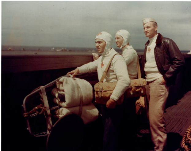
Figure 4-4. Flight surgeon and two hospital corpsmen (white caps and jerseys with red crosses) at their flight station in the starboard catwalk, amidships, on a training escort carrier, during World War II. They stand ready with medical kits, stretcher, blankets and other emergency gear. Photo courtesy of the National Archives and Records Administration, catalog no. 80-G-K-2618.

Although professional diving is documented as early as the 5th century BCE, the 18th and 19th centuries brought experiments with new forms of diving bells and submersible vehicles in Europe and the United States. 33 The physiology of extreme atmospheres in relation to both caisson disease in workers building supports for bridges and the medical experiences of submariners led to manuscripts written by Navy medical officers starting in 1916. 34 The first US Navy