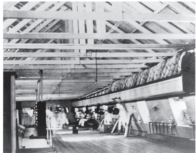
Figure 4-2. Spar deck of USS Independence while it was in use as a receiving ship in the early 1900s at Mare Island Navy Yard, California. Note hammocks stowed atop the bulwark, light guns installed in some of the gun ports, and the large wooden roof.

Hospital care for Navy and Merchant Marine sailors and marines began with the Seaman's Sickness and Disability Act of 1798. These naval personnel had funds deducted from their pay (starting at 20 cents