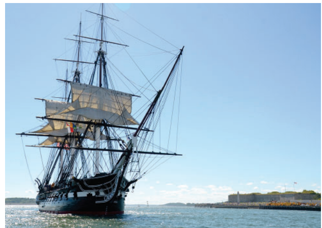
Figure 4-1. The USS Constitution , launched October 21, 1797, and authorized by the Naval Act of 1794, was one of the three original frigates of the US Navy and is today the oldest commissioned warship afloat. Boston Harbor, MA, August 29, 2014.

and the Constellation , and also specified the guidelines for compensation if a sailor or marine was wounded or disabled while serving in the line of duty.